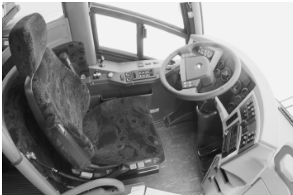
It did not take long to get comfortable in the driver's cockpit. The air ride ISRI seat with arm rests made driving a pleasure. Rocker switches with symbols are used on the panels on both sides of the steering wheel.

My notes say that the "dash is straight forward." Like the old PD4104, your gauges are in the center with controls on both sides. Rocker switches are used with graphic symbols. It took me a few hours to figure out what some of the symbols stood for and what the switches did. However, it did not take long to become comfortable. There is a cup holder on the left side panel as well as two 12-volt "cigarette lighter" plugs which today are more likely to be used for cellular phones.