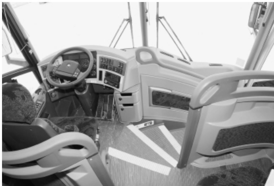
Some of the styling of the J4500, such as the curving front stepwell, is obviously inherited from the E4500 Renaissance model. The result is a modern looking coach which will appeal to passengers. Your editor was pleased to see cup holders on the left panel and those two drawers adjacent to the driver's right knee.

I will admit that I intentionally tried to get the AS Tronic to misbehave. I came out of rest stops at full acceleration with the pedal on the floor. The acceleration is impressive and the AS Tronic never had a bad shift. On other occasions, I tried varying degrees of engine settings and still got excellent shifts. Unless you are accelerating very slowly, the AS Tronic will skip gears as appropriate. I watched and dis-