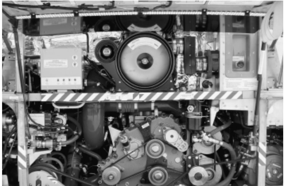
Detroit Diesel's Series 60 engine comes standard on the J4500 although other engines are available. Systems and service items in the engine compartment are easy to find and work on. Both drivers and mechanics should have no problem switching over to the J4500.

Earl Mountain at MCI told me that it was impossible for a driver to check the fluid level inside the AS Tronic. I later checked with others and found out this is true. Since the AS Tronic is essentially a manual transmission, there is no dipstick. Instead the oil level is checked by opening the fill plug on