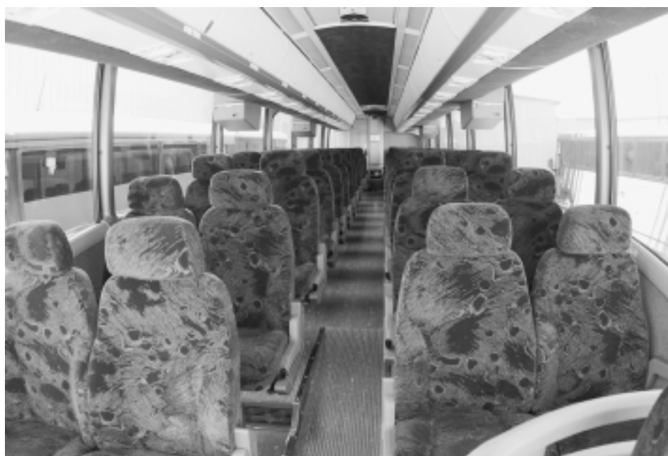
The interior of the J4500 is sure to please passengers. Large windows give the coach an open feeling, and the enclosed parcel racks and optional entertainment systems match airline amenities. There is also a restroom at the right rear of the coach.

covered that it almost never followed the same pattern.