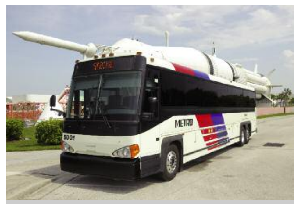
MCI pioneered hybrid Commuter Coaches in 2003 with coaches for New Jersey Transit. Houston Metro placed a major order for MCI hybrid Commuter Coaches in 2007. Shown here, the Houston hybrids are 45 feet long with the Allison hybrid system and a Cummins engine.

In 2007, MCI was awarded a contract to provide Commuter Coaches to Houston Metro with the Allison Hybrid System. These were the 45-foot MCI D4500 model equipped with the Allison's EP50 Hybrid System and a smaller Cummins engine. MCI continues to offer the Allison Hybrid System with a smaller Cummins engine as