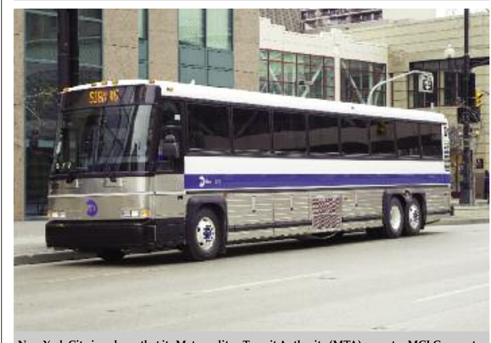
New York City is so large that its Metropolitan Transit Authority (MTA) operates MCI Commuter Coaches on several routes within the city limits. Due to the distance between the five boroughs of New York, MTA operates Commuter Coach routes serving Manhattan, Staten Island, Brooklyn, Queens and the Bronx. Some of these routes only operate in rush periods.

an optional power system on Commuter Coaches.