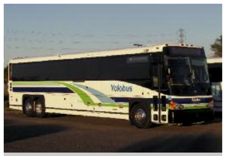
MCI Commuter Coaches are also used effectively in providing service to smaller cities. Yolo County Transportation District operates their Yolobus service west from Sacramento, California.