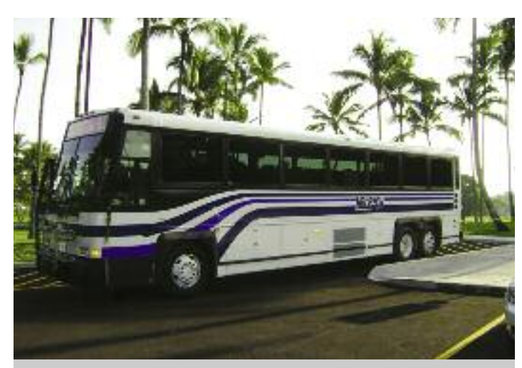
The County of Hawaii operates MCI Commuter Coaches in its Hele-On service on Hawaii's largest island of Hawaii. Routes not only cross the island but also serve the volcano district on the southern shore.

Trains (the old New York Central line along the Hudson) for commuters and day trippers going to Grand Central Station. The New York State Transit Agency recently purchased nine MCI Hybrid Commuter Coaches. Three of these coaches will go to the Rockland County Department of Public Transportation for use on the line.