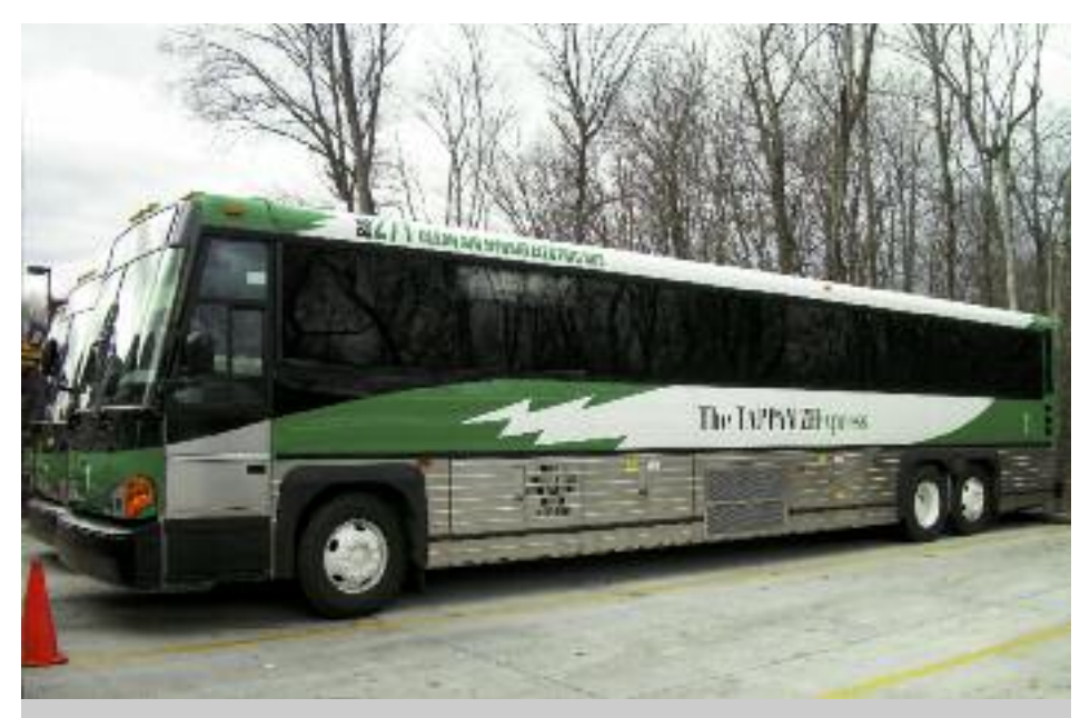
Basically a crosstown line, the Tappan ZEExpress line operates east and west in an area north of New York City. The line gets its name because its uses the famous Tappan Zee Bridge to cross the Hudson River. Three MCI Commuter Coaches were recently acquired by Rockland County for use on this line.

New York City's Metropolitan Transit Authority (MTA) is also a big operator of MCI Commuter Coaches. Like most municipal transit agencies, New York's MTA also runs local routes using conventional transit buses. Unlike most municipalities, New York City is so large that there are several routes where express Commuter Coach service is not only practical but highly desirable. The most obvious of these operate from the borough of Manhattan to the other boroughs including Staten Island, Brooklyn, Queens