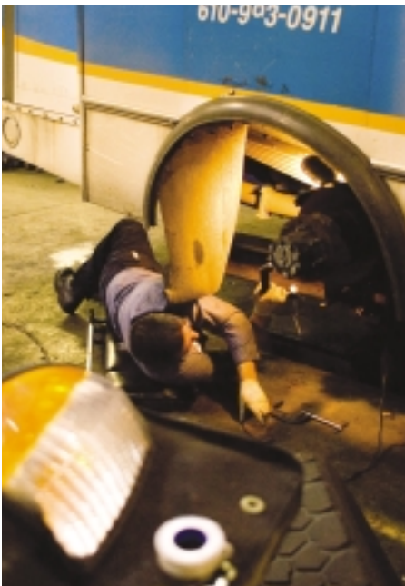
Work is being completed on the rear wheel of one of the smaller buses. In addition to their own fleet, Krapf's also operates services for government agencies, private companies and schools. ABC COMPANIES.