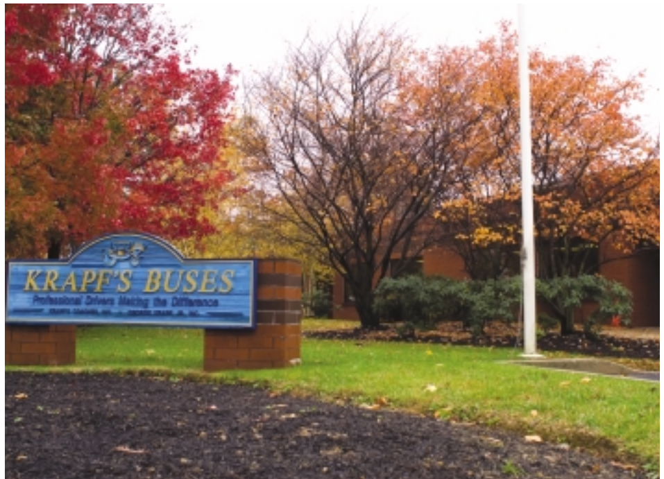
This modern sign outside of the Krapf building reads: "Professional Drivers Making the Difference." Starting from a single school bus in 1942, Krapf Bus Companies has grown into a major operation in Pennsylvania. The company celebrated its 65th anniversary in 2007.

challenge of increasing competition because of deregulation, the coach operation began to downsize and move in the direction of diversification and higher class service. Due to the transit and paratransit operations, Krapf's has been able to offer a wide selection of vehicles and services that meet the needs of smaller groups and specialized applications. Efforts were directed at looking for new and different ways to increase revenue, controlling costs, and offering value to customers.