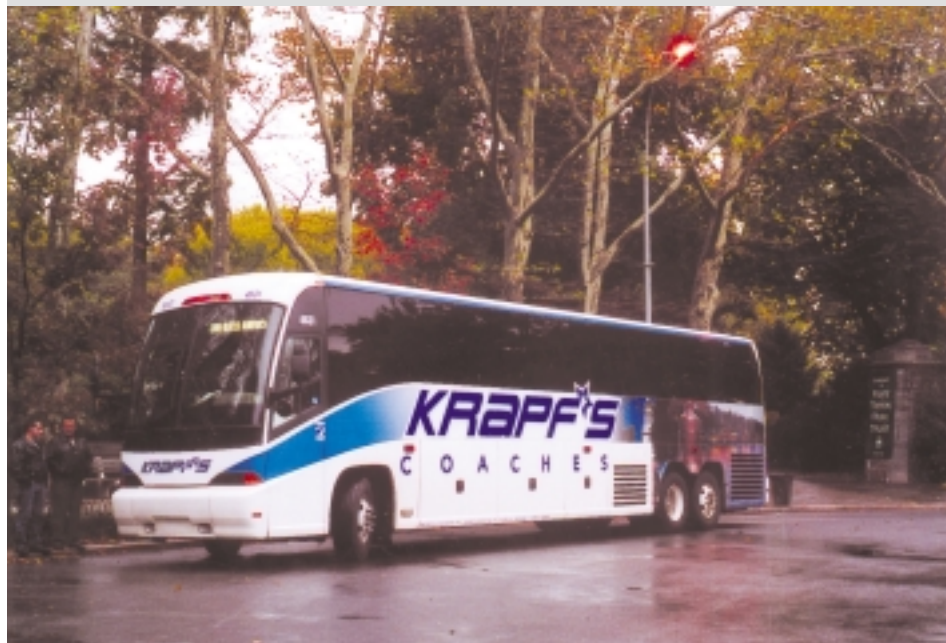
This MCI 2003 J4500 from the Krapf's Coaches fleet was photographed on November 9, 2007 while on charter in New York City. The location is Fort Tryon Park. Krapf's Coaches operates both MCI D and J models.