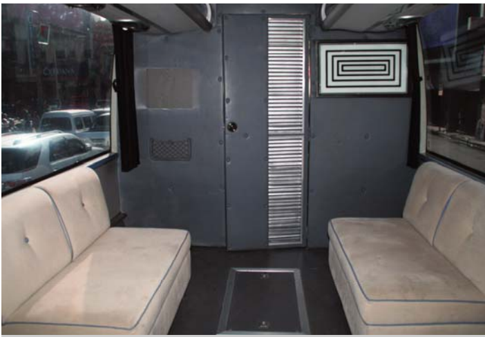
Looking towards the front, this photo shows the compartment at the rear of the bus with two couches that could be used for additional seating or storage.