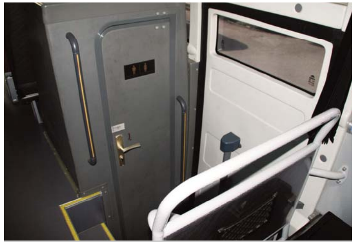
Regular seating has been retained back to the rear door and adjacent restroom. There is a sideways seat on the driver's side opposite the rear door.

and retire. Recently started was a new Mindanao Railway Project that will connect Davao City with Digos, Tagum and other major cities on Mindanao.