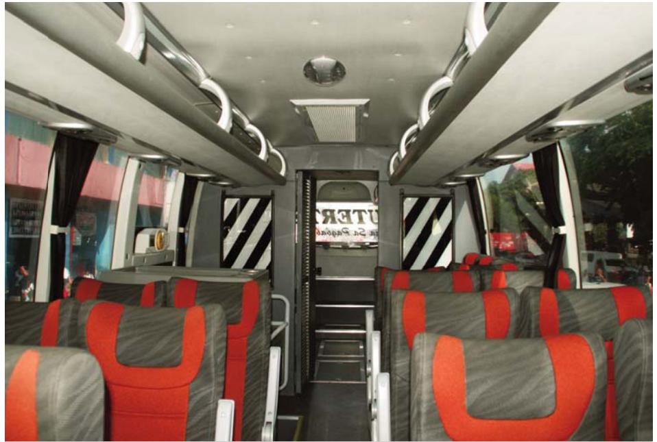
This photo was taken from the aisle and looks towards the back of the coach. Regular seating and overhead parcel racks have been retained in this area. The door at the back of the aisle opens into the rear compartment.

To say that the campaign bus was well received would be an understatement. Newspapers reported that it took hours for the bus and caravan to enter the city of