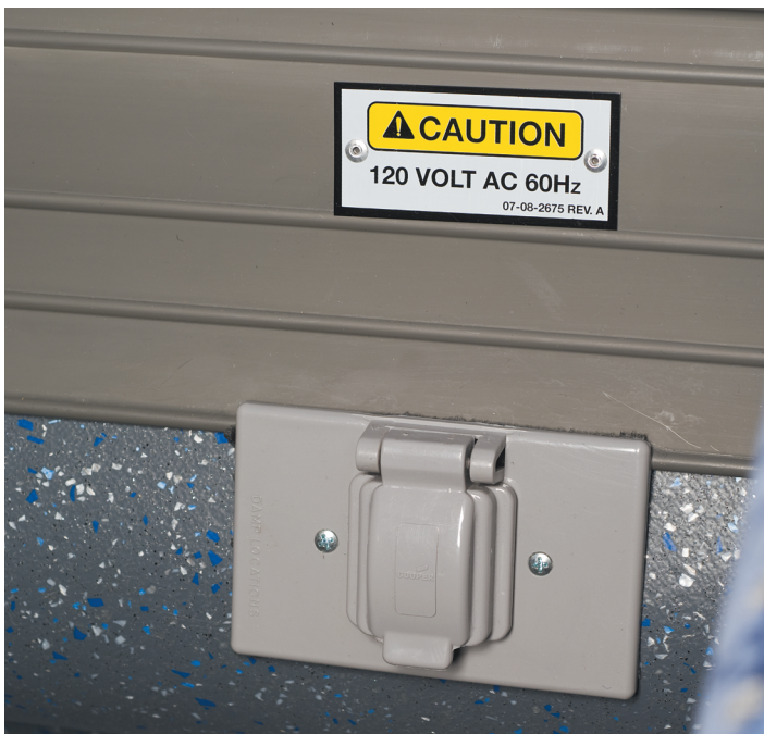
New features for passengers include optional wireless Internet, iPod connectivity and these 120-volt outlets at the seats that permit passengers to plug in their laptops. MCI.