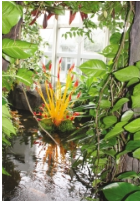
This photo was taken in the Asian area of the Franklin Park Conservatory. That bright object in the center of the photo is not a plant but one of the Chihuly examples of glass art on display.

Again boarding our Coach Quarters bus, we drove just north of downtown Columbus on High Street. Our stop was at Camelot Cellars Winery, Ltd. This unique operation bills itself as a “full service boutique win-