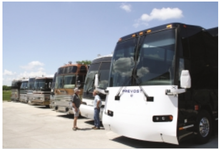
An obvious highlight of the stop at the new CMI facility was an opportunity to inspect some of the consignment coaches in the back row. Some of the coaches had very low mileage and carried attractive price tags. Some of the MCI members showed some interest in the coaches.

members of the group continued talking about buses until well into the evening.