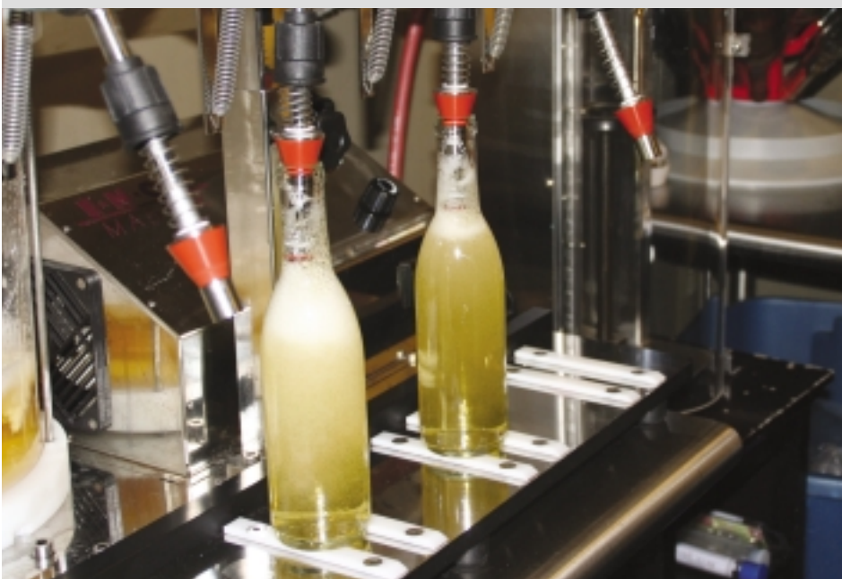
The stop at Camelot Cellars proved to be both interesting and educational. Here, we had a hands-on experience filling bottles with white wine. We also learned a great deal about both white and red wines and had the opportunity to taste examples of each.

MCII members gathered at a picnic table and on lawn chairs between the coaches for an official chapter meeting. Topics ranged from approving the minutes of the previous meeting to activities at the recent FMCA convention in Bowling Green as well as nominating new officers, seeking new members and planning future chapter activities.