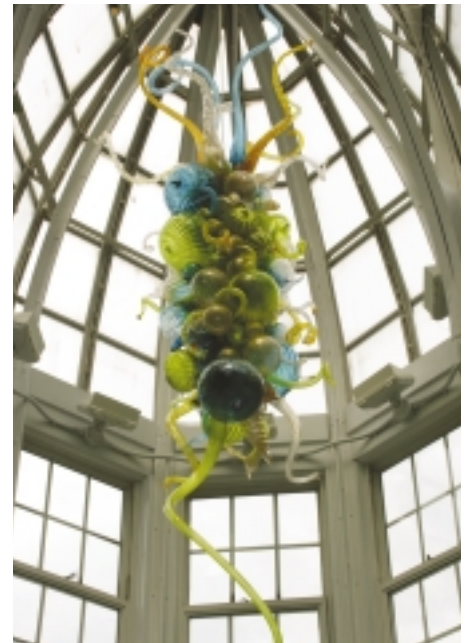
Another example of Chihuly glass art was hung from the top of this glass dome in the Franklin Park Conservatory. This one included globes, swirls and numerous other glass objects.

Due to the size of our group, the staff from Camelot Cellars split us into smaller groups for three different activities. One consisted of an information session and tasting of white wines. The second was a more elab-